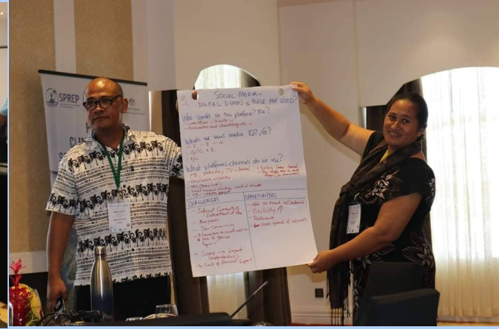
Group activity on challenges faced by met directors with media

EDNRE staff enhances her knowledge on effective communications from a Mana Class facilitated by SPREP at Sheraton Hotel on the 2^{nd} of August 2019 before attending the PMC meeting from the 5^{th} - 9^{th} August 2019.