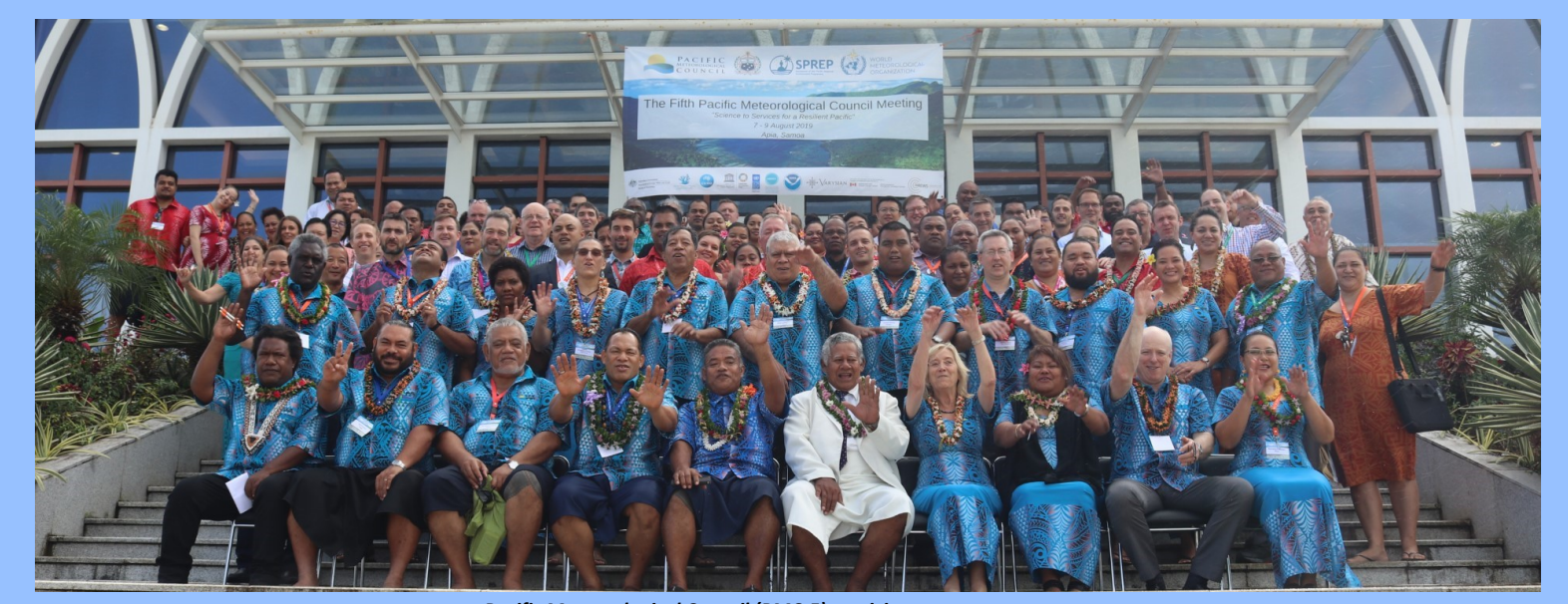
Pacific Meteorological Council (PMC-5) participants

The Ministry of Natural Resources and Environment (MNRE) of the Government of Samoa hosted the Fifth meeting of the Pacific Meteorological Council (PMC-5) in Apia from 5th to 9th August 2019. The meeting brought together PMC's members, government officials from SPREP member countries and partners, to discuss, promote and explore opportunities to strengthen weather, climate, water and ocean services. Background history of the PMC.