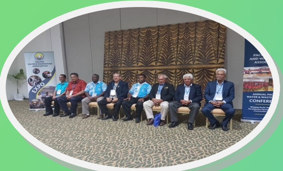
Ministers of Water Sector from Pacific Region